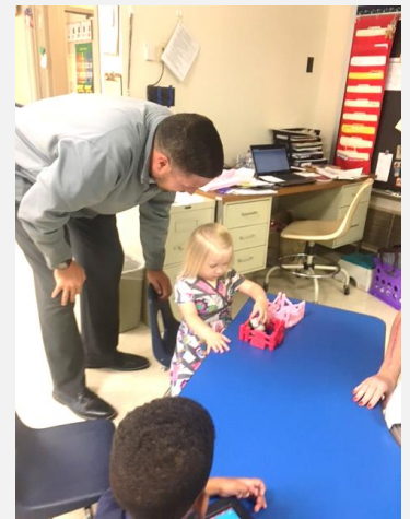
Working hard in preschool!