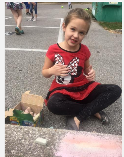
Sidewalk chalk artist!!