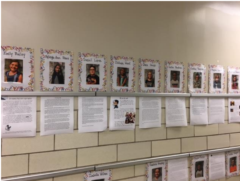
We have authors in 5 th grade!!!